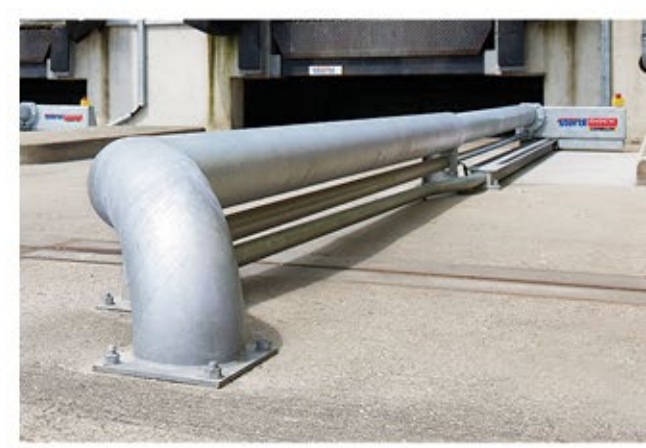
Easy to install above ground.