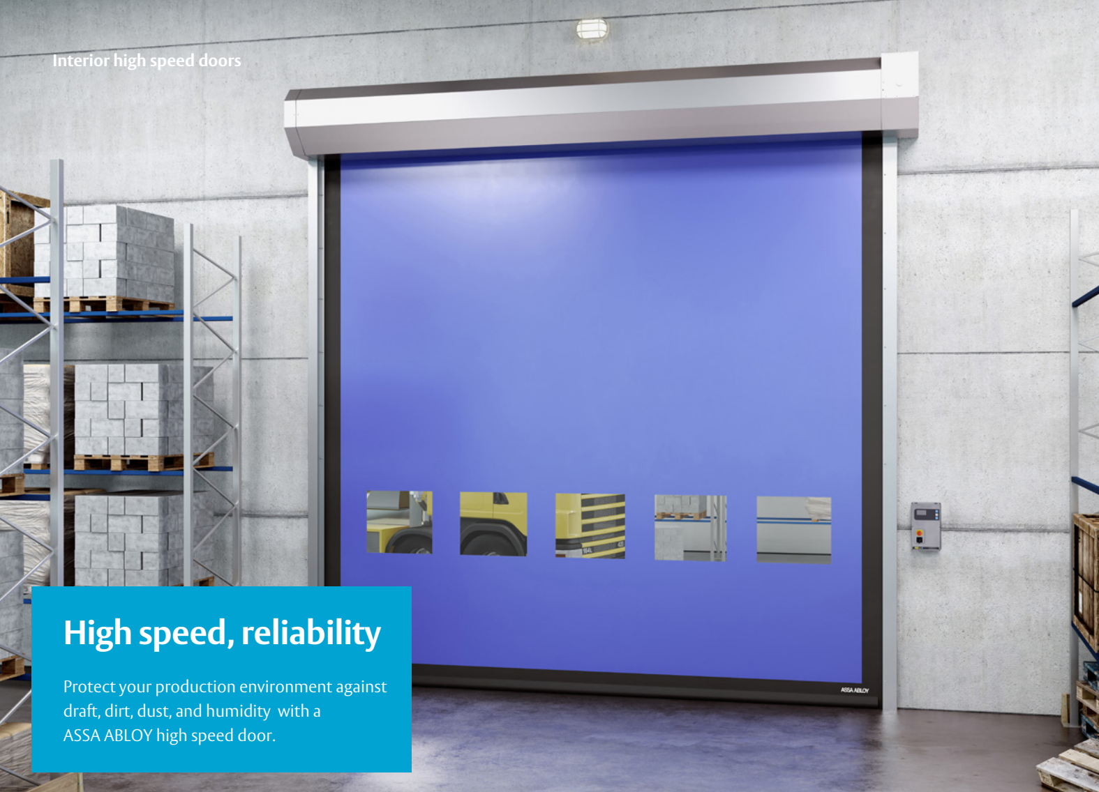
Interior high speed doors