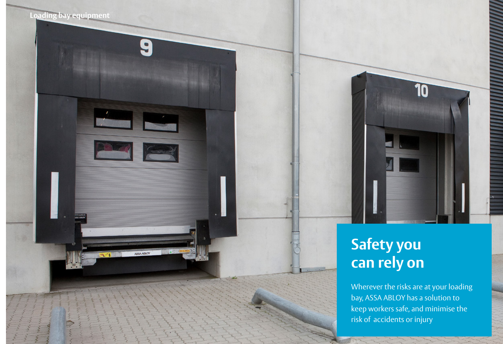
Loading bay equipment

Unlike light curtains, which can be physically breached, machine protection doors prevent workers from reaching into the process area and bringing production to a standstill. And they take up much less space on the shop floor as there is no need for light barriers.