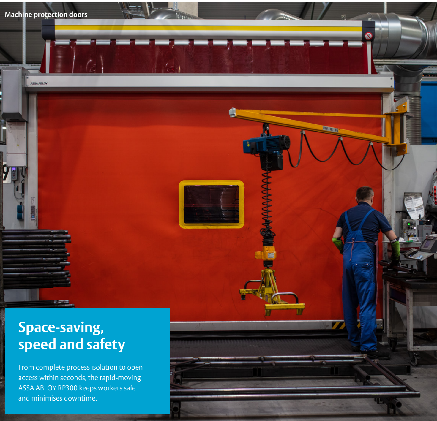
Machine protection doors