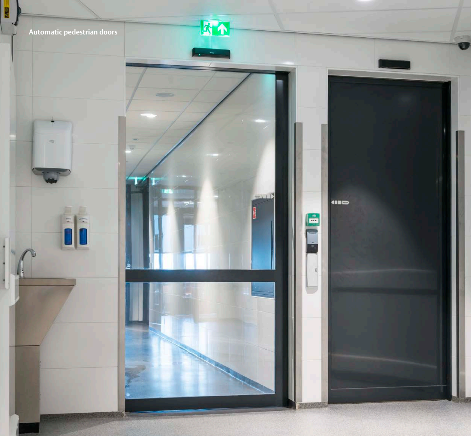
Automatic pedestrian doors