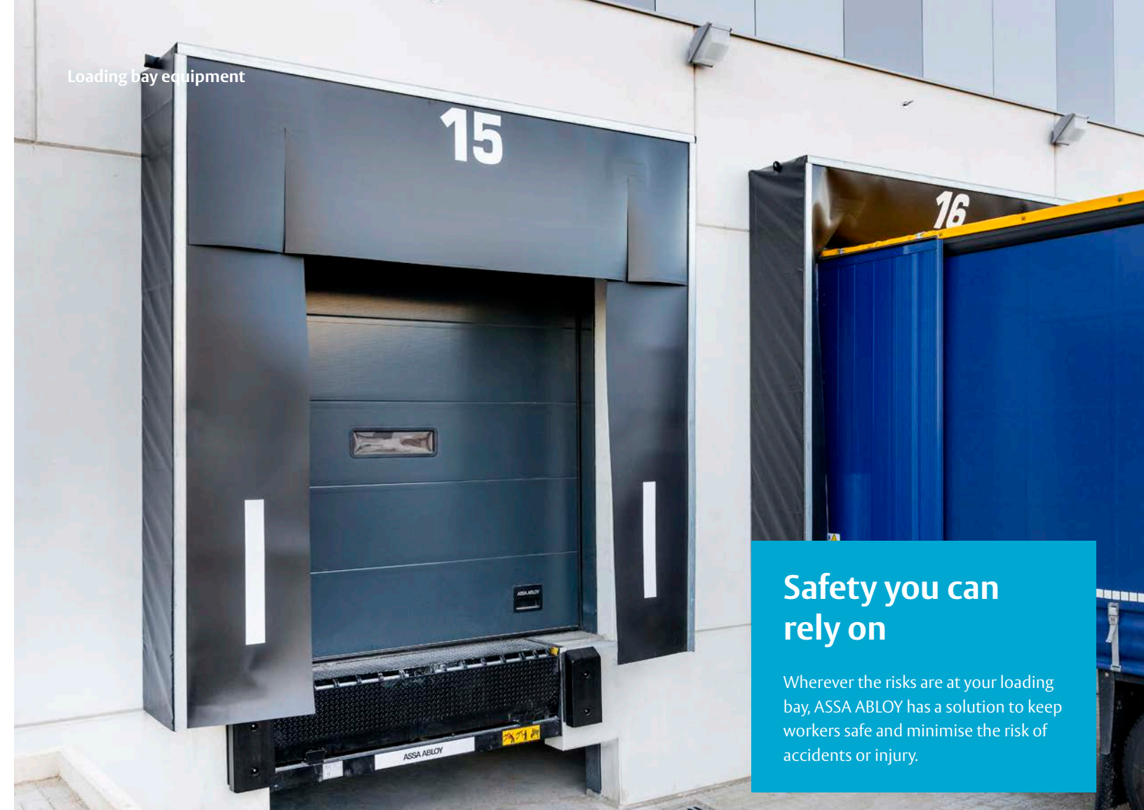
Loading bay equipment

All our doors meet strict industry standards and help minimise the spread of airborne particles or risk of contamination, ensuring that the strictest hygiene and safety standards are not compromised.