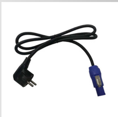
DLAC-PC-200 2m Powercon Mains Lead