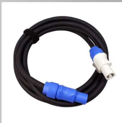
DLAC-PC-500 5m Powercon Connection Lead *EXPO 150 TRI-COLOUR ONLY*