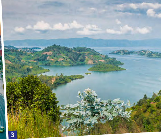
1. Elephants in Amboseli National Park of Kenya. 2. Sunrise in Namibia's capital Windhoek. 3. Majestic landscape: view of lake Kivu in Rwanda.