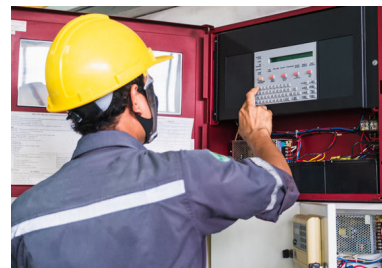
Fire Alarm Maintenance (FAM)