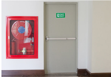
Fire Door Risk Assessments (FDRA)