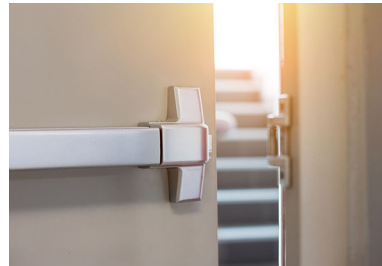
Fire Door Supply & Installation (FDSI)