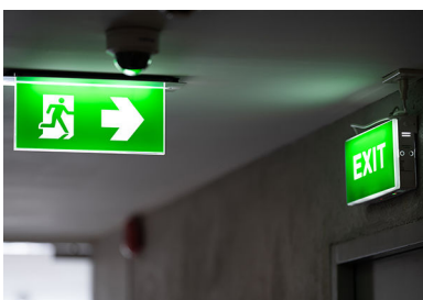
Emergency Light Testing (ELT)