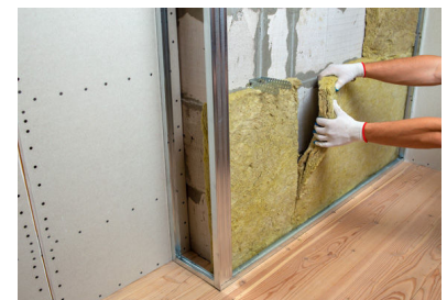
Dry Lining (DL)

OCD FM delivers a range of Fire Protection Services across a wide range of commercial and residential properties. Specialising in approved fire doors and fire door risk assessments, risk assessments, dry lining and passive fire protection. FIRAS approved.