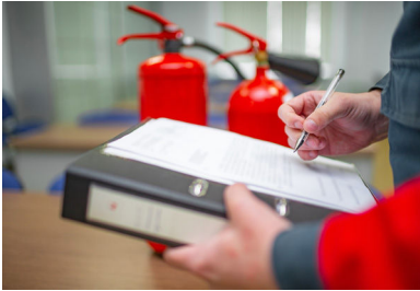
Fire Risk Assessments (FRA)

Here you'll find more information on the fire protection services that OCD-Fire Management provide. As well as specialising in Approved Fire Doors, Surveys and Inspections, and Fire Stopping we also provide the following: