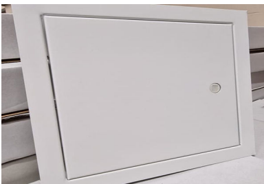
Fire Rated Access Panels (FRAP)