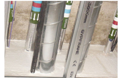
Fire Stopping (FS)