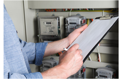
Fire Compartmentation Surveys (FCS)