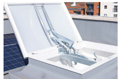
Automatic Opening Vent Maintenance (AOVM)