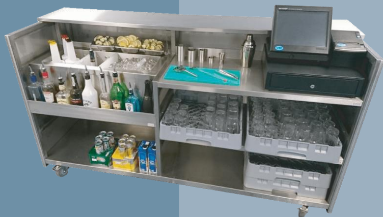
MOVERBar - Cocktail Servery MB1990C - £4,840