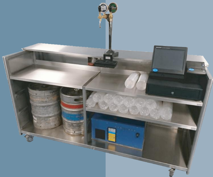
MOVERBar - Beer Dispense MB1990B - £3,490