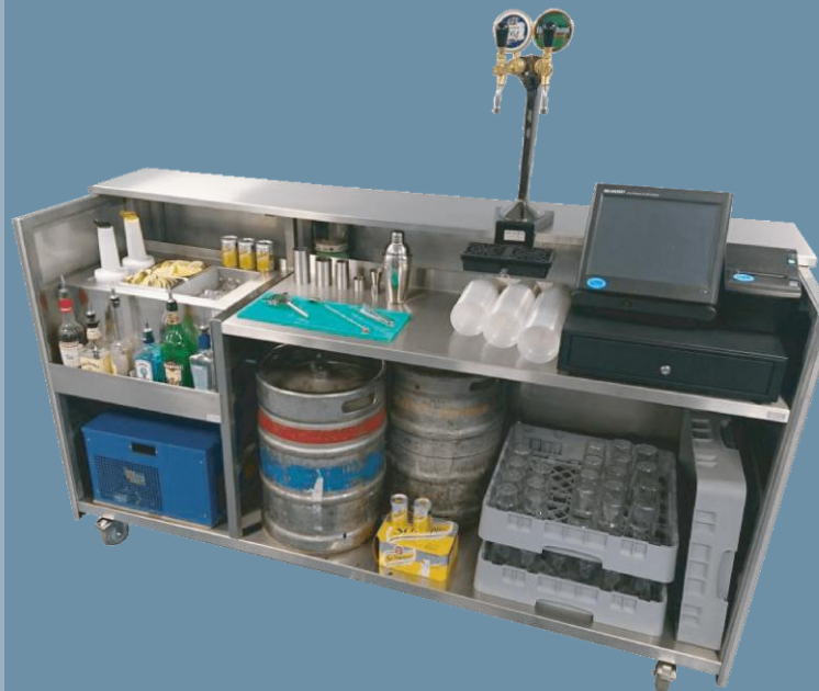
MOVERBar - Beer Dispense & Cocktail Servery MB1990BC - £4,540