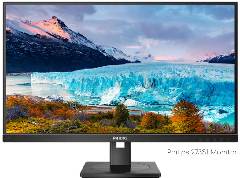
Philips 273S1 Monitor

It promotes flexibility, cost-effectiveness, customisation and adaptability to enhance employee satisfaction, increase productivity and simplify remote collaboration.