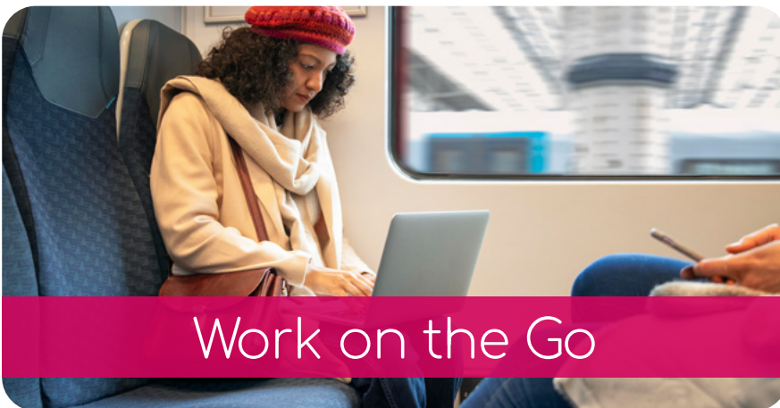
Work on the Go