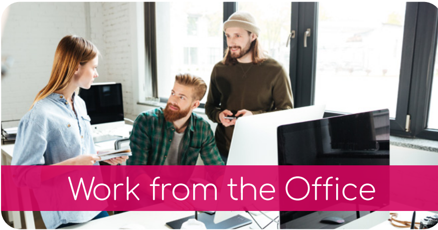
Work from the Office