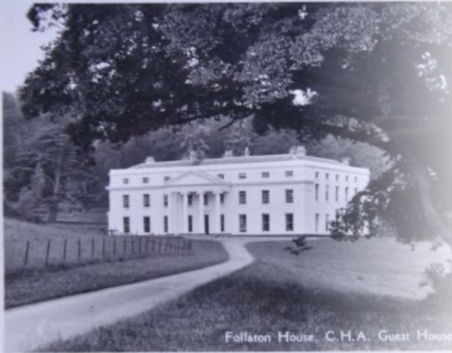
Follaton House, C.H.A. Guest House, Totnes