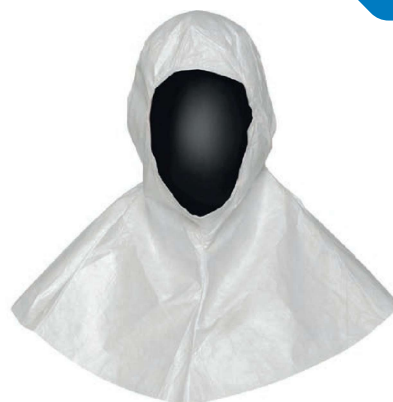
IC668 B WH MS