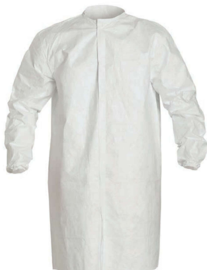
IC270 B WM MS