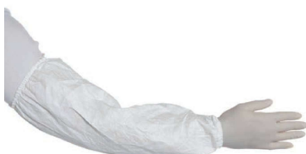
IC501 B WH MS