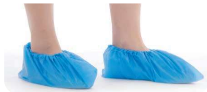
OS1 / OS2