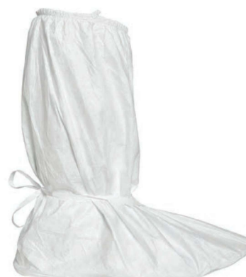
IC458 B WH MS