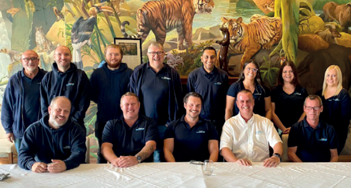
Meet the Higher Elevation team