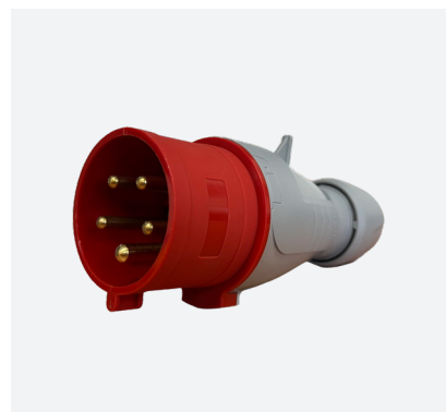
Available in 16amp 3 phase Supplied in 16amp 3 phase to suit your preferred or existing power supply.