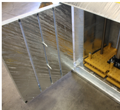
Galvanised finish Corrosion-resistant coating for outdoor or harsh, wet environments.

Customise your machine with the optional extras listed below – designed to help you get the most from your equipment, and to suit your specific requirements, operational needs, or site layout.