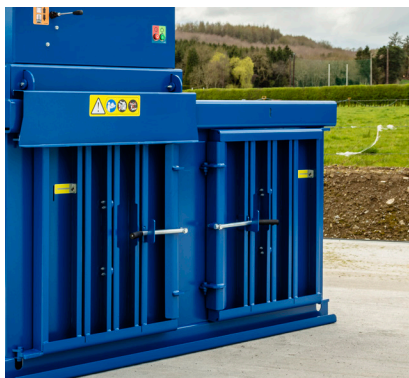
Additional chamber Add extra chambers for multi-stream waste, reducing loose material stored onsite.