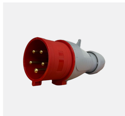
Available in 16amp 3 phase Supplied in 16amp 3 phase to suit your preferred or existing power supply.