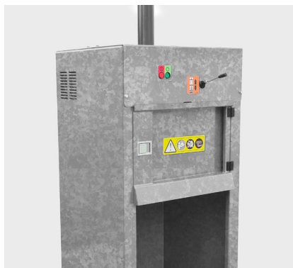
Galvanised finish Corrosion-resistant coating for outdoor or harsh, wet environments.

Customise your machine with the optional extras listed below – designed to help you get the most from your equipment, and to suit your specific requirements, operational needs, or site layout.