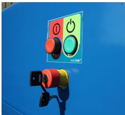
Auto PLC control panel with auto cycle Includes automatic compaction cycle, E-stop, and key-lock control.