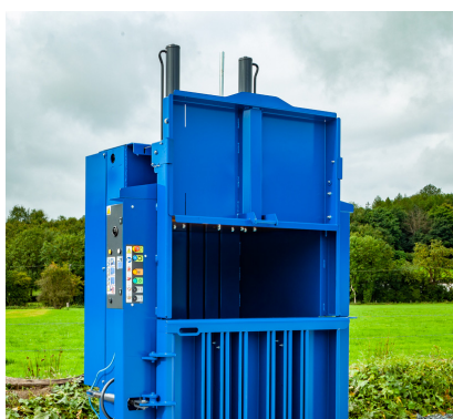
Sliding top door Space-saving loading door for use in confined areas or where forklifts/vehicles are operating.