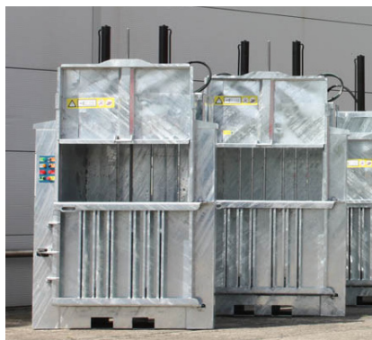
Galvanised finish Corrosion-resistant coating for outdoor or harsh, wet environments.

Customise your machine with the optional extras listed below – designed to help you get the most from your equipment, and to suit your specific requirements, operational needs, or site layout.