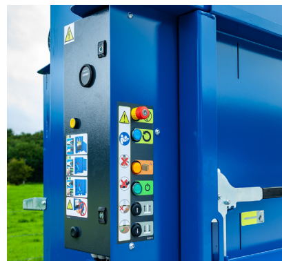
Auto PLC control panel with bale full light Includes automatic compaction cycle, bale full indicator, E-stop, and key-lock control.