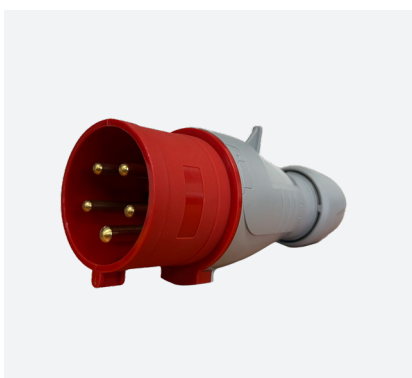
Available in 16amp 3 phase Supplied in 16amp 3 phase to suit your preferred or existing power supply.