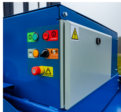
Auto PLC control panel with bale full light Includes automatic compaction cycle, bale full indicator, E-stop, and key-lock control.