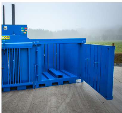
Additional chamber Add extra chambers for multi-stream waste, reducing loose material stored onsite.