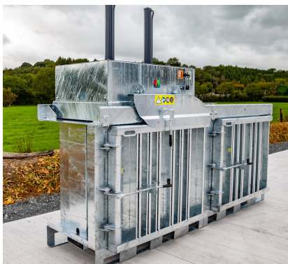
Galvanised finish Corrosion-resistant coating for outdoor or harsh, wet environments.

Customise your machine with the optional extras listed below – designed to help you get the most from your equipment, and to suit your specific requirements, operational needs, or site layout.