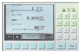
ABB is your partner: From consulting and project planning to engineering and after-sales support.