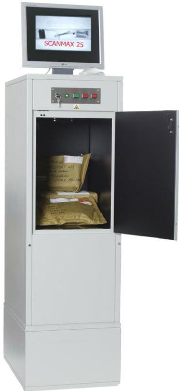
Scanmax 25 (Scanna Msc Ltd)