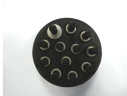
12 x 6mm tube connection OUT