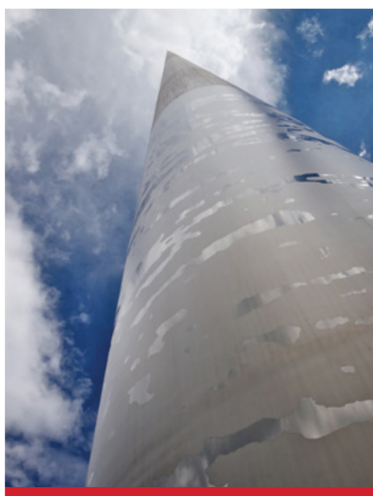
The Dublin Spire – a stunning example of our surface texturing technique showing the versatility of controlled shot peening