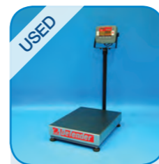
H13514 Ohaus Defender 3000 parcel scales 60kg x 10kg