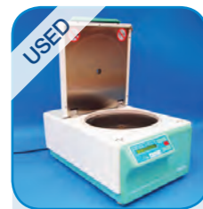
R13550 Hettich Universal 32R refrigerated centrifuge