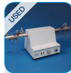
S13907 Stuart SF1 8 place wrist action flask shaker