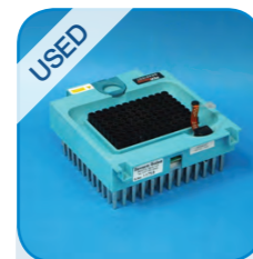
N11758 Hybaid HBPXBG05 PCR block accessory