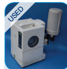
P13730 Buchi V-700 diaphragm vacuum pump