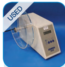
U13873 Erweka TA 10 friability tester 0