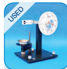
H13503 Kruss K6 tensiometer surface tension balance