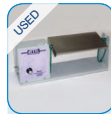
S11789 ATR Rotamix Model RKVS end-over-end tube rotator