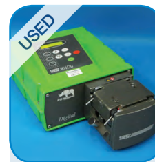
P13987 Watson Marlow 504DU peristaltic pump with 505L low pulse pump head