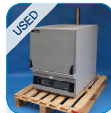
M13676 Carbolite OAF 10/1 ashing furnace