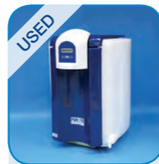
X13614 Purite Select Analyst IT 40 deioniser