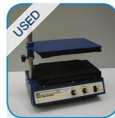
S11510 SMI multi tube vortex mixer