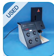
E13875 Sherwood 410 flame photometer