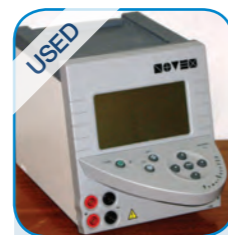
G10063 Novex Power Ease 500 x 2