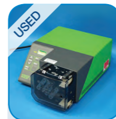
P13764 Watson Marlow 505U peristaltic pump and 501RL pumphead