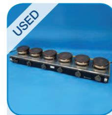
V13957 Gerhardt EV26 six place hot plate