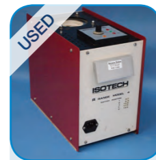
U13984 Isotech 899 R Range Model 4 calibration block