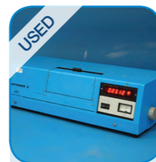
J13981 Schmidt & Haensch Polartronic E polarimeter