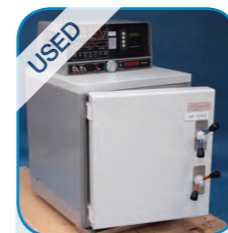
N13891 Boxer 200/50L autoclave