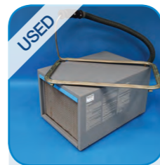
W5175 Grant CS25 refrigeration immersion cooler