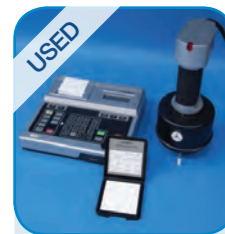
U13849 Minolta CR-231 chroma meter with built in data processor and printer