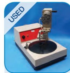
U13458 Struers DAP-7 Polisher with Pedemin sample mover attachment - 2 available