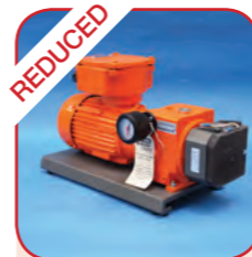
P12848 Watson Marlow 501DV/RL2GA ATEX peristaltic pump