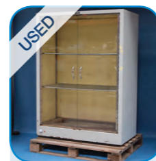
K13998 LEEC F1 drying cabinet