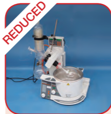
Y13924 Heidolph Laborata 4001 efficient rotary evaporator & vac controller - 3 available