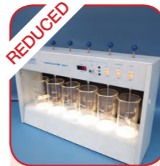
S14007 Stuart SW1 flocculator