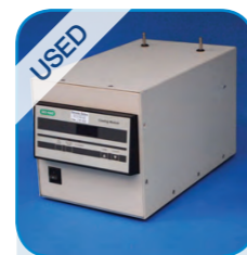
G5593 Bio Rad cooling module