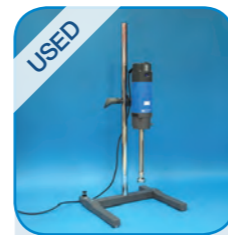
S13651 IKA Ultra Turrax T 50 Basic disperser homogeniser mixer