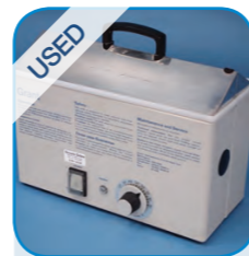
W14004 Grant JB1 static waterbath x 2