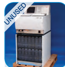
N13973 Leica TP1050 automated vacuum tissue processor