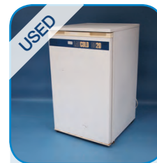
L13992 Labcold RLVF 0420 sparkfree freezer x 6