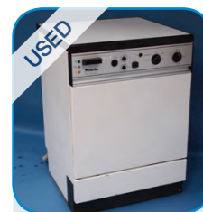
A13867 Miele G7733 glassware washer