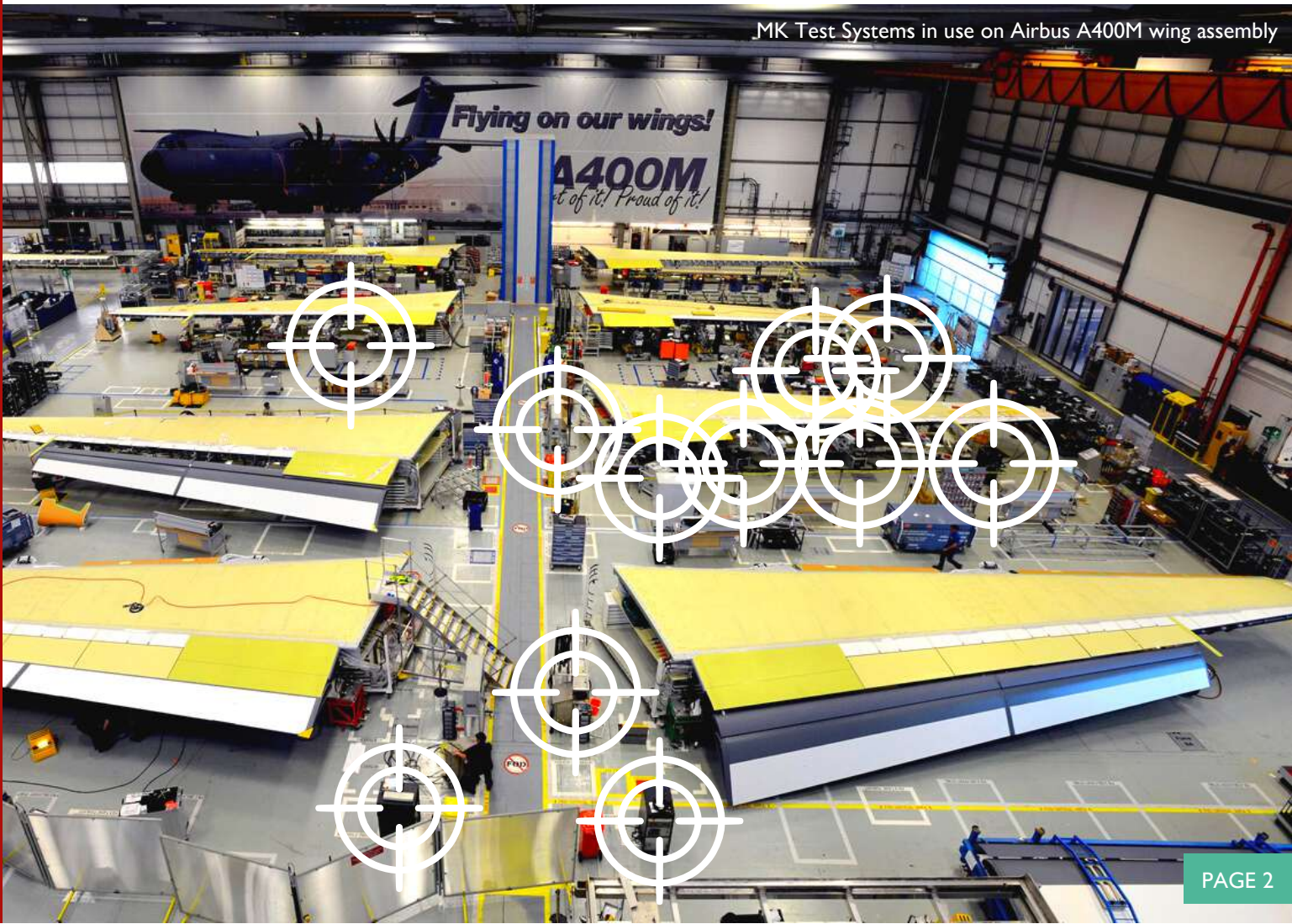
MK Test Systems in use on Airbus A400M wing assembly