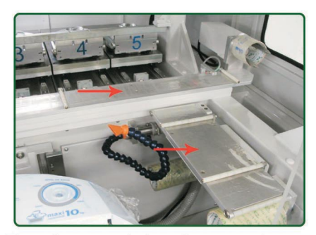
Two Auto pad cleaning attachment