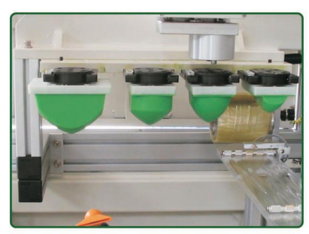
Auto pad change