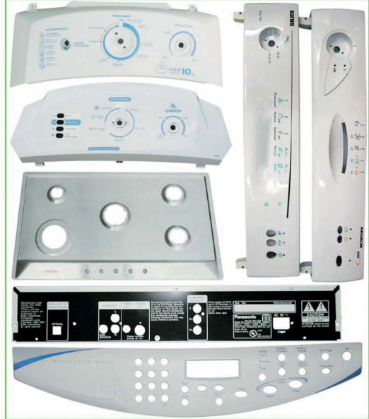
Ideal for complex jobs, multi-positions large/ long products

* In relate to various different printing movement, parameter, extra fee may be needed to be involved. Need process under monitoring with the guideline of experienced Kent Technician.