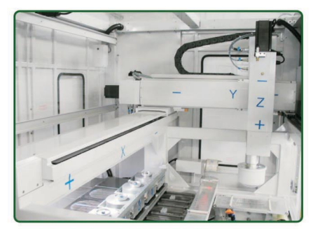
Move along X,Y,Z axis by CNC robot