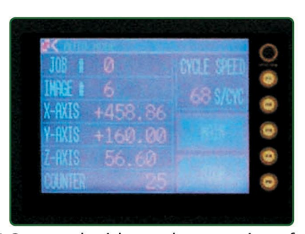
PLC control with touch screen interface