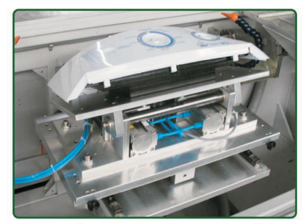
Innovative auto adjustable tilting jig for multi-angle printing