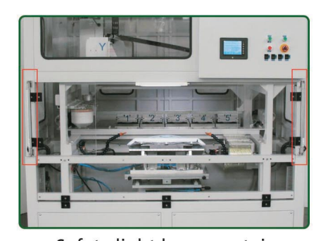
Safety light beam curtain