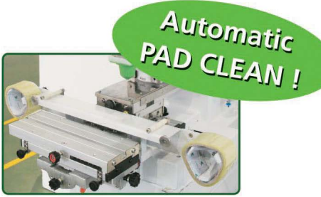
on ink cup model only