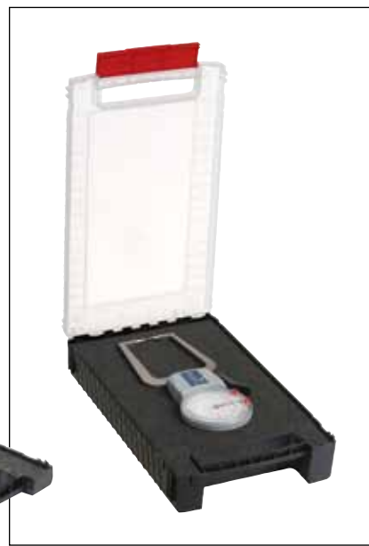
▲ mechanical external measuring gauge in the B 6692