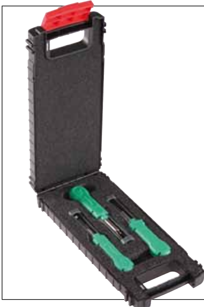
▲ releasing tools in the B 6361