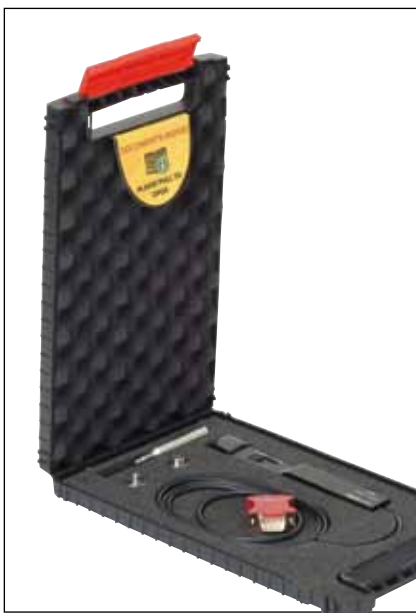
▲ sensors and accessories in the B 6691

Find the perfect case sizes also for instruments and measurement devices with small dimensions