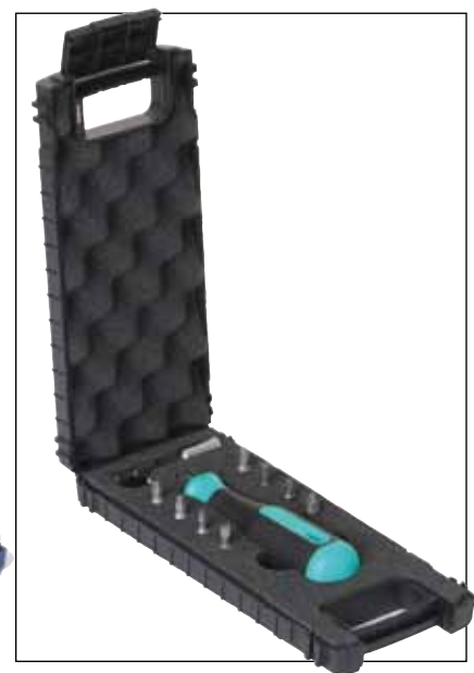
▲ bit set in the B 6361