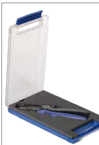
▲ crimping hand tools in the B 6691