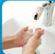
Prevents hard scale forming on taps

Softwater is water that contains very little natural minerals; this 'pure' water is actually aggressive to metals and causes corrosion. Consequently the tap water turns brown. Leaks and burst pipes may be the result.