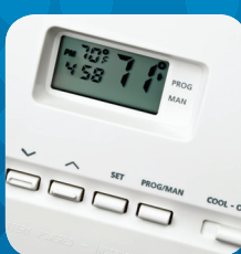
Maintains your boiler's energy efficiency