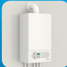
Protects boilers and keeps pipework clear