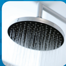
Shower heads & screens are easily cleaned