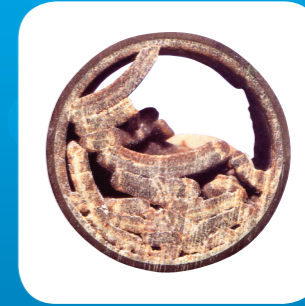
Copper pipe with scale plug

Hard waters form scale in pipes and boilers. Limescale leads to decreased water pressure, flow rates and an increased energy demand. Clogged pipes may have to be replaced. Heating coils may overheat and fail.