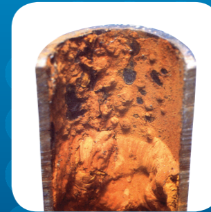
Galvanised pipe heavily corroded