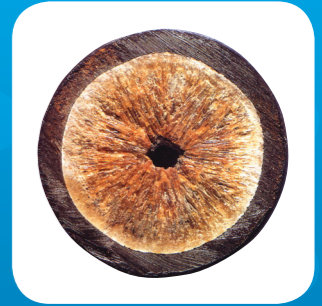
Galvanised pipe heavily scaled