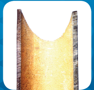
Combiphos protective layer