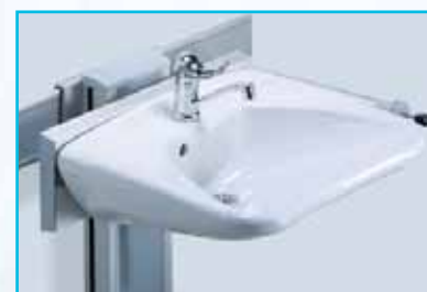
HL-2, 25cm - 30cm