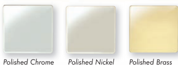
Polished Chrome Polished Nickel Polished Brass

*Minimum point charge of £35 for quantities of less than 25. Mobile phones and chargers not included.