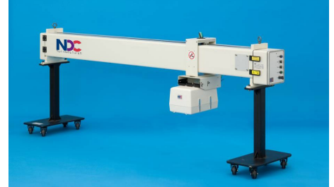
MiniTrak Single-Sided Scanner

The MiniTrak S-Frame supports both the backscatter and reflection family of intelligent iSensors™ from NDC. This frame is compact, robust and supports up to two scanning intelligent iSensors. It requires minimal installation space and can provide critical measurements from difficult process locations.