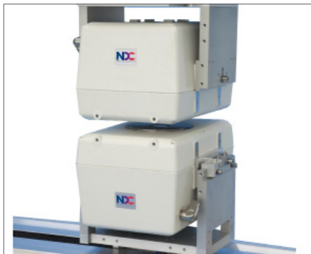
▶ X-Ray Transmission

Laser gauges are typically designed to measure thick nonwoven products. The thickness measurement range for NDC's single-sided sensor is 50 mm, while the dual-sided range extends to 15 mm.