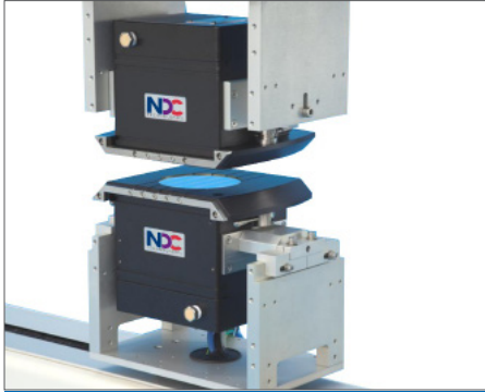
▶ Transmission Beta

A complete gauging portfolio for the entire nonwovens process