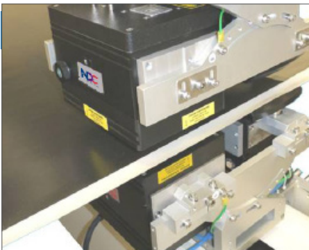
▶ Laser Thickness

NDC's Gamma BackScatter (GBS) gauge family provides a cost-effective basis weight measurement. This compact sensor can provide valuable measurements from difficult process locations.