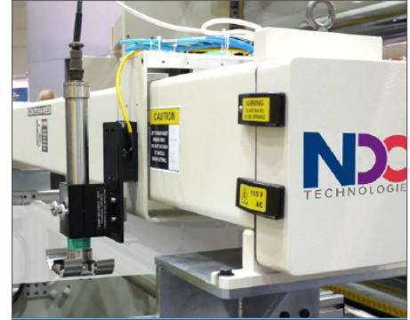
▶ Gamma Backscatter

Applications include PP spunbond and meltblown nonwovens.