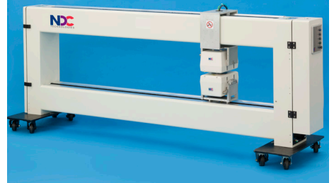
AccuTrak O-Frame Scanner

NDC's MiniTrak scanner family offers fast, accurate, reliable measurement that is tightly integrated into an intelligent, distributed web gauging architecture from NDC.