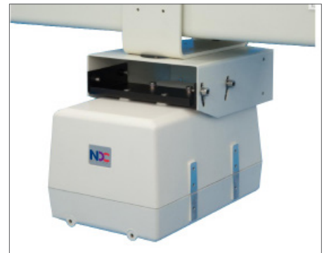
▶ X-Ray Backscatter

X-ray transmission gauges can be used on most nonwovens processes.