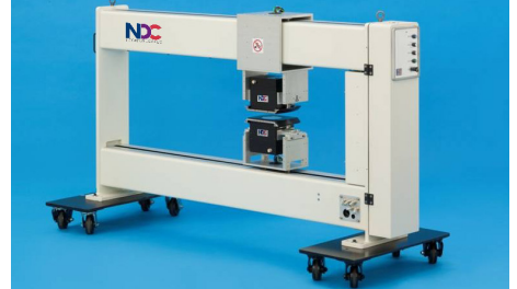
MiniTrak O-Frame Scanner

The MiniTrak S-Frame supports both the backscatter and reflection family of intelligent iSensors™ from NDC. This frame is compact, robust and supports up to two scanning intelligent iSensors. It requires minimal installation space and can provide critical measurements from difficult process locations.