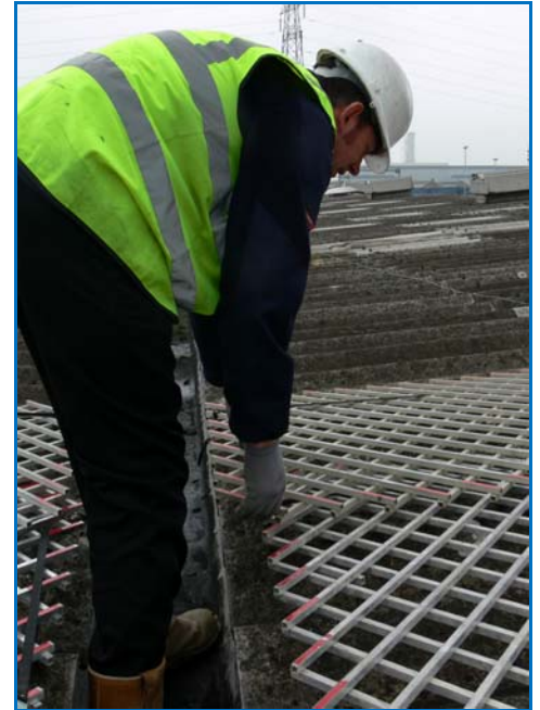
Spreading the first mats each side of a valley where work is to take place