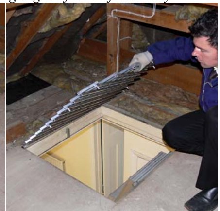
Platform hinges up for full access

The concept and design is protected by patents and patent applications for UK and other countries