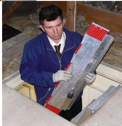
Bringing Voidy into attic space