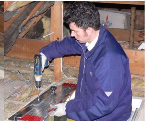
Fixing edge to frame of hatchway