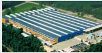
Hörmann Genk NV, Belgium