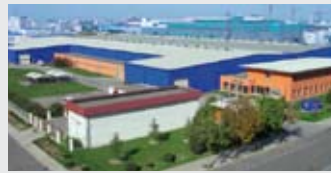
Hörmann Beijing, China