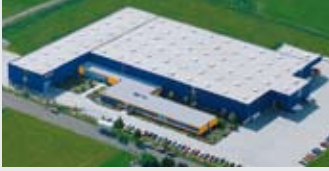
Hörmann KG Dissen