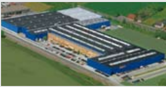
Hörmann KG Werne