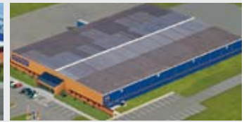
Hörmann Gadco LLC, Vonore TN, USA

Hörmann is the only manufacturer worldwide that offers you a complete range of all major building products from one source.