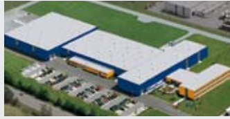
Hörmann KG Antriebstechnik