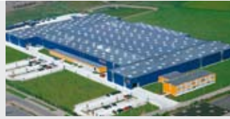
Hörmann KG Brandis