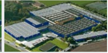
Hörmann KG Brockhagen