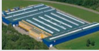
Hörmann KG Eckelhausen