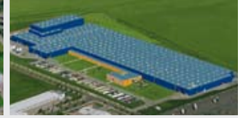
Hörmann KG Ichttershausen