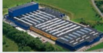
Hörmann KG Freisen