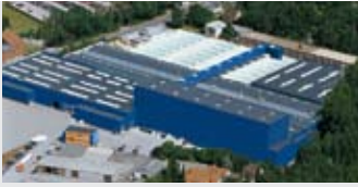
Hörmann KG Amshausen