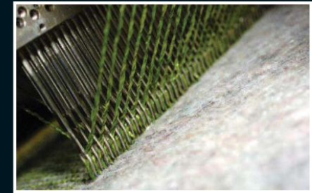
Needles punch yarn through the backing cloth