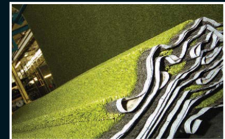
TigerTurf quality inspection