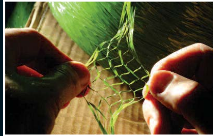
Working in partnership with yarn manufacturers

Through on-going research and development, TigerTurf monitors materials used with the aim of finding more efficient manufacturing and installation methods. We are also involved in research projects that look closely at recycling old style synthetic turf and developing 100% recyclable products for the future.