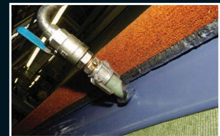
Latex is applied during the backing process