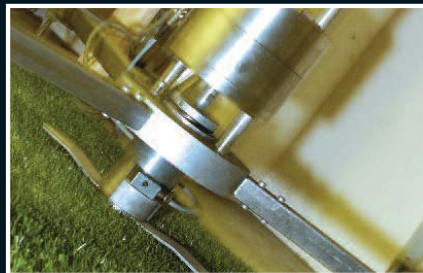
Bio-mechanical impact testing