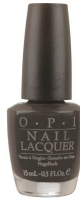
LADY IN BLACK

What a year, what a vintage, what a great colour.