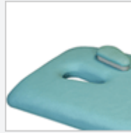
O24 Integral nose hole in head section with wedge to plug the hole.