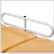
A2 Side Rails Provide additional patient safety. Fold down.