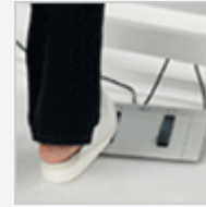
O27 Alternative electronic double footswitch control.