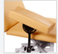
A7 single/ A11 pair Phlebotomy Arm Shaped adjustable arm fits into side of unit. Detachable.