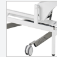
Base Base variant allows hoist access. Bespoke sizes available