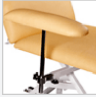
A8 Arm Supports Upholstered side pads support arm and hand. Can be raised/lowered. Detachable.