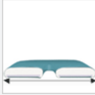
O21 Additional +3" width on couch. Other widths to order.