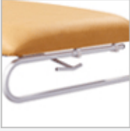
A1 Towel Rail Allows full extension of paper over couch. (Included)