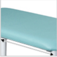
O20 Shorter length on couch. Other lengths available to order.