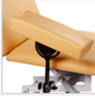
A7 Phlebotomy Arm (single) Shaped adjustable arm. Detachable. (Included)