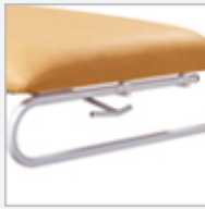
A1 Towel Rail Allows full extension of paper over couch.