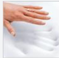
O25 Additional top layer of pressure relieving memory foam.