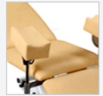
A6 Leg Troughs-pair Can be raised/lowered/ rotated. Detachable.