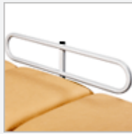
A2 Side Rails Provide additional patient safety. Fold down.