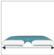
O21 Additional +3" width on couch. Other widths to order.