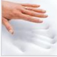
O25 Additional top layer of pressure relieving memory foam.