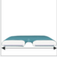
O21 Additional +3" width on couch. Other widths to order.