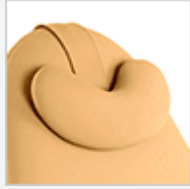
A3 Head Cushion Provides patient support. Detachable.