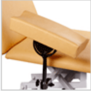
A7 single/ A11 pair Phlebotomy Arm Shaped adjustable arm fits into side of unit. Detachable.