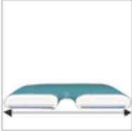
O21 Additional +3" width on couch. Other widths to order.