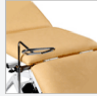
A5 Ankle Stirrups - pair Can be raised/lowered/ rotated. Detachable.