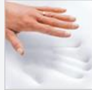
O25 Additional top layer of pressure relieving memory foam.