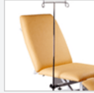
A4 IV Pole Fits either side. Height adjustable/detachable.