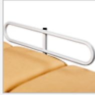
A2 Side Rails Provide additional patient safety. Fold down.