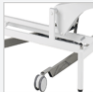
Base Base variant allows hoist access. Bespoke sizes available.