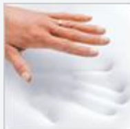
O25 Additional top layer of pressure relieving memory foam.