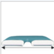
O21 Additional +3" width on couch. Other widths to order.