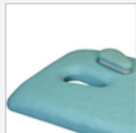
O24 Integral nose hole in head section with wedge to plug hole.