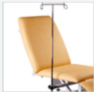
A4 IV Pole Fits either side. Height adjustable/detachable.