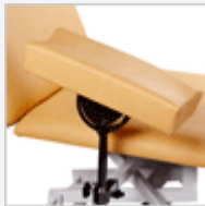
A7 single/ A11 pair Phlebotomy Arm Shaped adjustable arm fits into side of unit. Detachable.