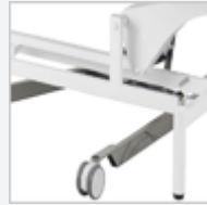
Base Base variant allows hoist access. Bespoke sizes available.