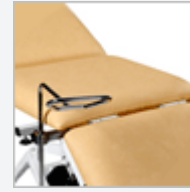
A5 Ankle Stirrups-pair Can be raised/lowered/ rotated. Detachable.