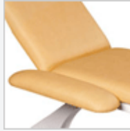
A9 Arm Extensions Upholstered side supports add comfort and extend width of couch. Fold down.