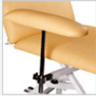
A8 Arm Supports Upholstered side pads support arm and hand. Can be raised/lowered. Detachable.