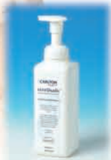
Sterilsafe™ Hand Mousse

A simple, easy to use, pump action mousse to protect you and your clients. Un-perfumed - No alcohol. Totally cleanses the hands and forms a nano-spic film for long lasting protection. Gives rapid, long lasting protection.