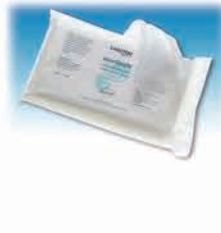
Sterilsafe™ Surface Wipes

This indispensable hand cleanser and protector is also available in a practical 1 Litre container with handle in order to easily refill the 600ml hand mousse bottle.