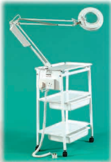
CC 305/DDGLF Standard