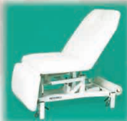
(shown without extendable footrest)