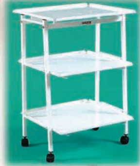
CC 305 Large