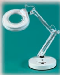
TABLE MODEL CC 70/LF3

Particularly recommended for intensive close work such as electrolysis. This lamp has a unique bi-focal lens giving the choice of 3 diopter or 8 diopter. As with all the lamps in this collection it may be mounted on to any fitting shown below*.