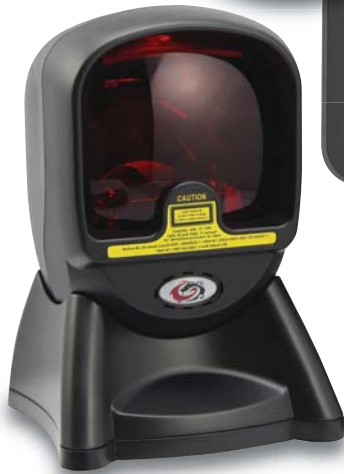
Featured hardware includes a Sam4s Titan 150 Touch Screen & XL-2020 Scanner.