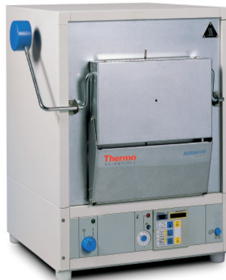
Thermo Scientific Heraeus K 114 Chamber Furnace Chamber volume: 3.5 l