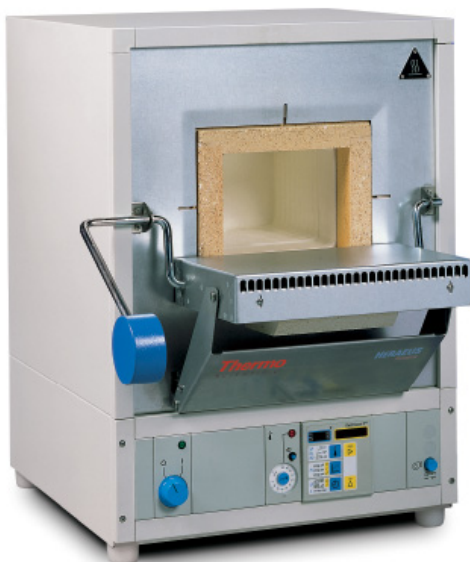
Thermo Scientific Heraeus M 104 Muffle Furnace Chamber volume: 3.5 l