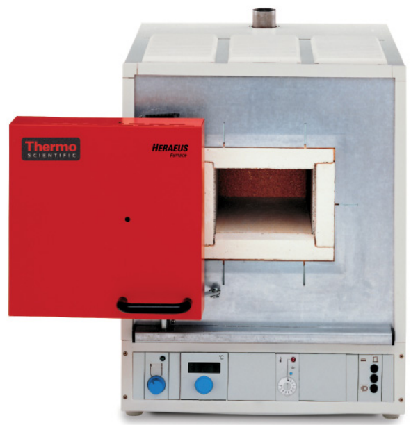
Thermo Scientific Heraeus M 110 Muffle Furnace Chamber volume: 9 l