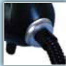
Quick Connect Hose