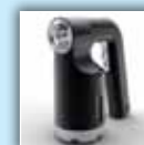
Adjustable Fan Pattern