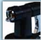
Patented Alloy Nozzle for Easy Application