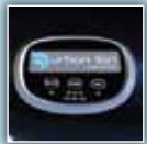
Variable Speed Control & Heat Function