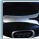
Ergonomic Carry Handle