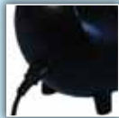
Cleanable Air Filter