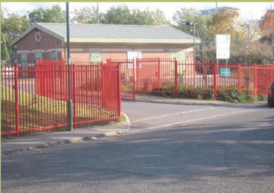
Railed type fencing incorporating vehicle gates, manually operated