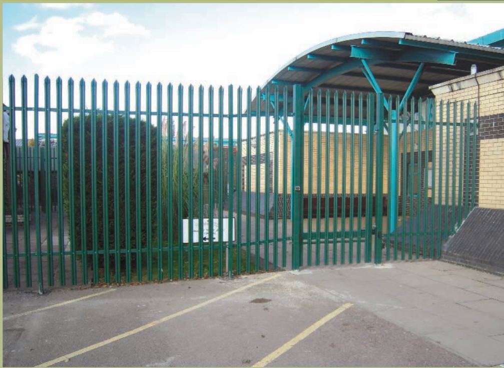
Pallisade pedestrian gate automated with access control and a hydraulic ram operator