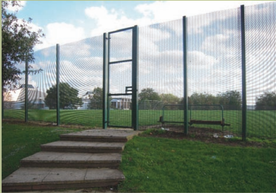
Sports Mesh fencing with pedestrian gate, powdercoated green