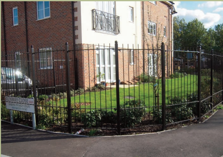
Fully welded railings to secure gardens to flats