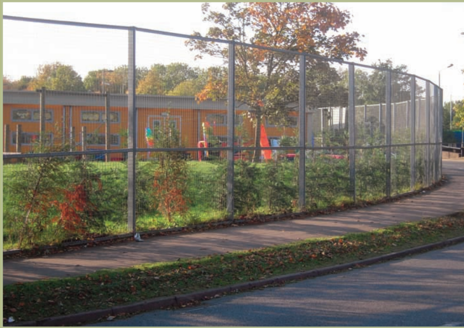
Curved mesh fencing