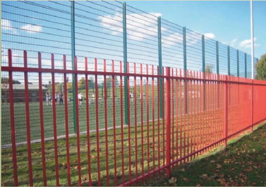
Sports mesh in standard green, with red railed fencing