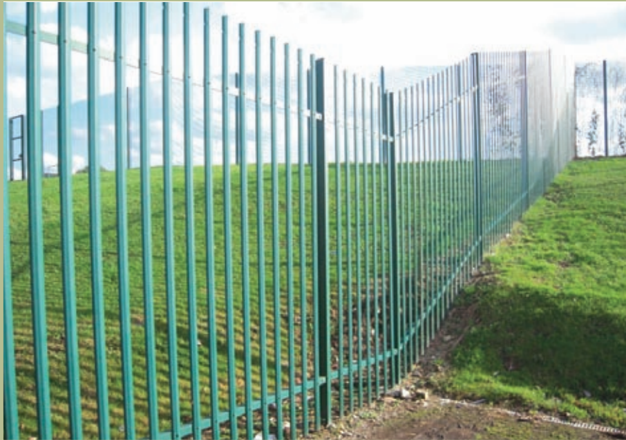
Standard green palisade, round top fencing