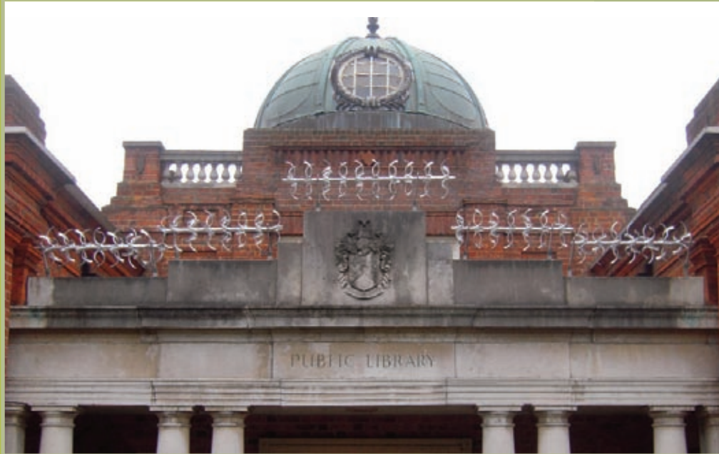
Anti climb, Rotating spikes