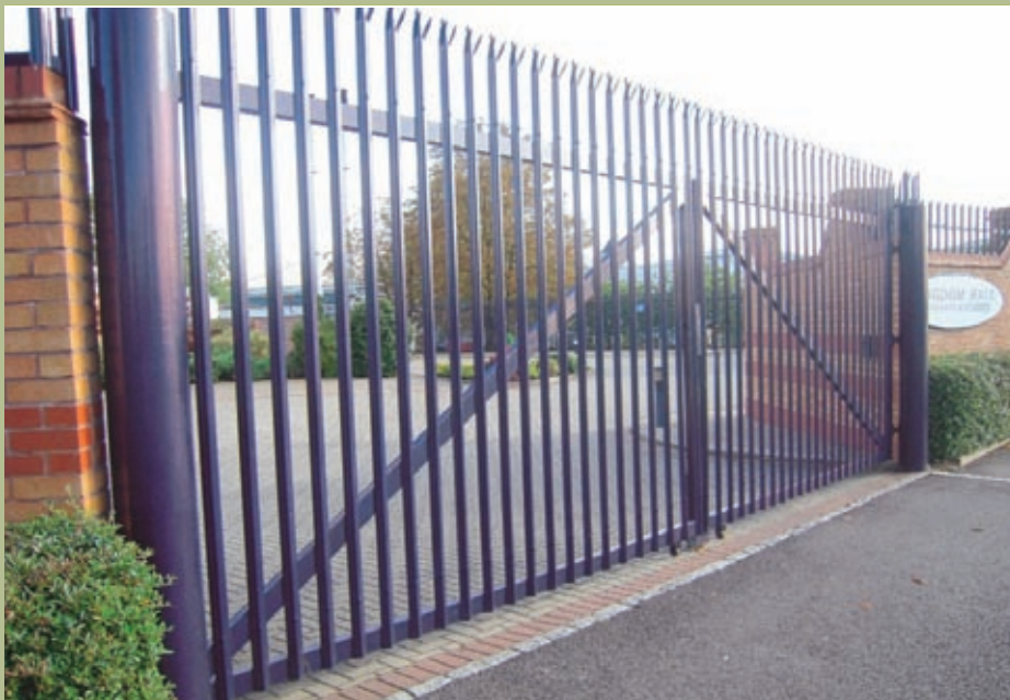
Pallisade gates with spiked top and manual operation