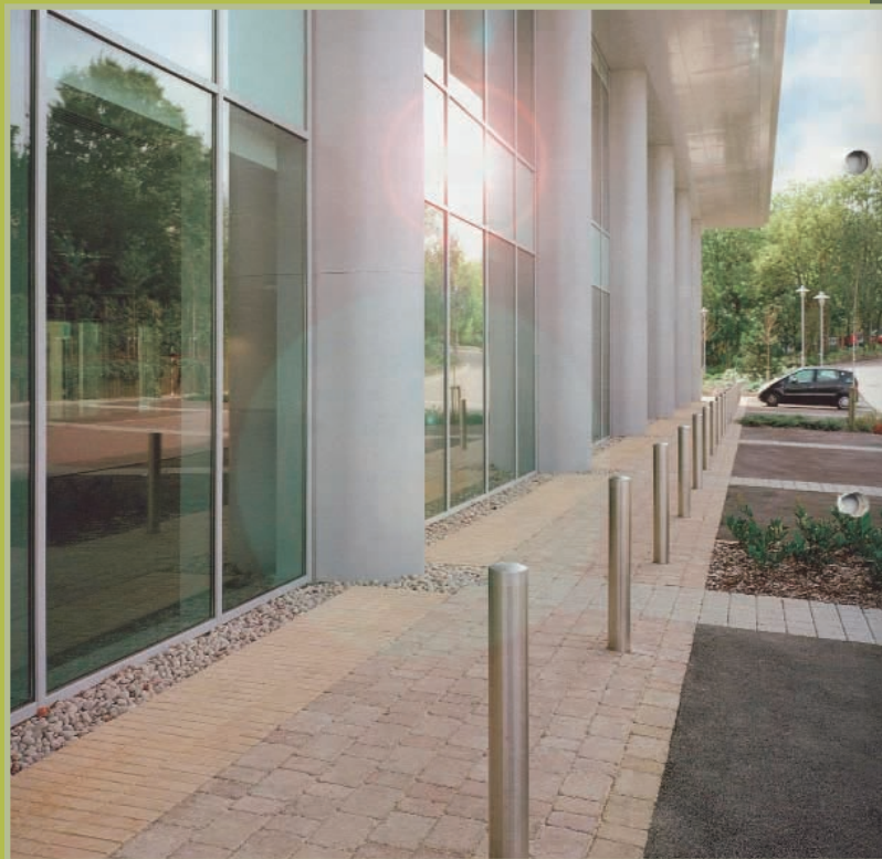
Stainless steel fixed bollards