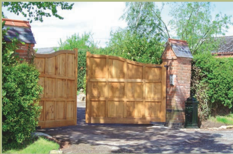
Automated wooden gates, with hardwood panels. Oakdene design