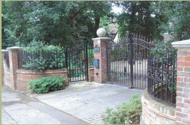
Steel gates with pedestrian gate and curved railings to match