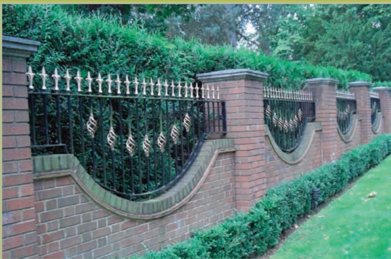
Decorative Railings, that were manufactured to match a pair of gates, a basic railing design with finials on top and twist scrolls in the centres.