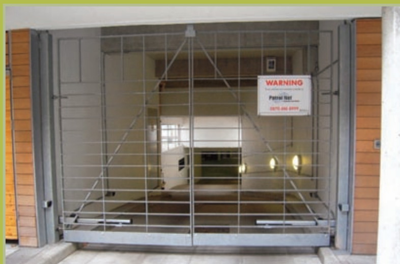
Galvanised double swing gates, automated by hydraulic rams. Manufactured to Architects design