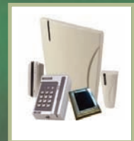
Readers and automation accessories