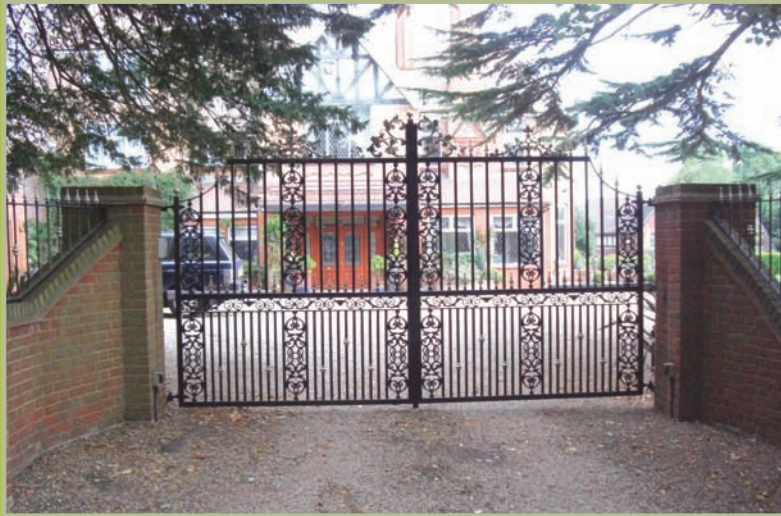
Traditional gates and railings, automated by hydraulic rams. 'Victoria' gate design