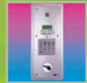
Digital Intercom panel