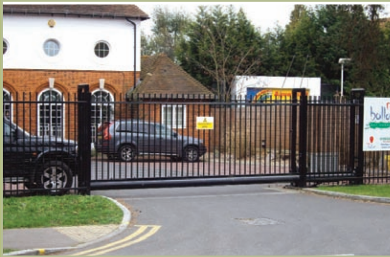
Harling 'Alley gate' design, sliding gate with cantilever action. This avoids having a ground track for the gate to run on.