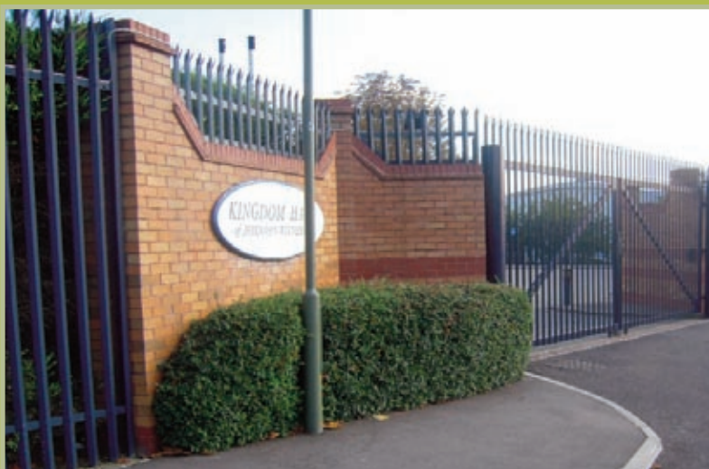
Pallisade fencing with manual gates to match, lockable by key.