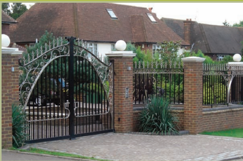
Decorative Gates and Railings, bespoke design, fully automated with Intercom system.