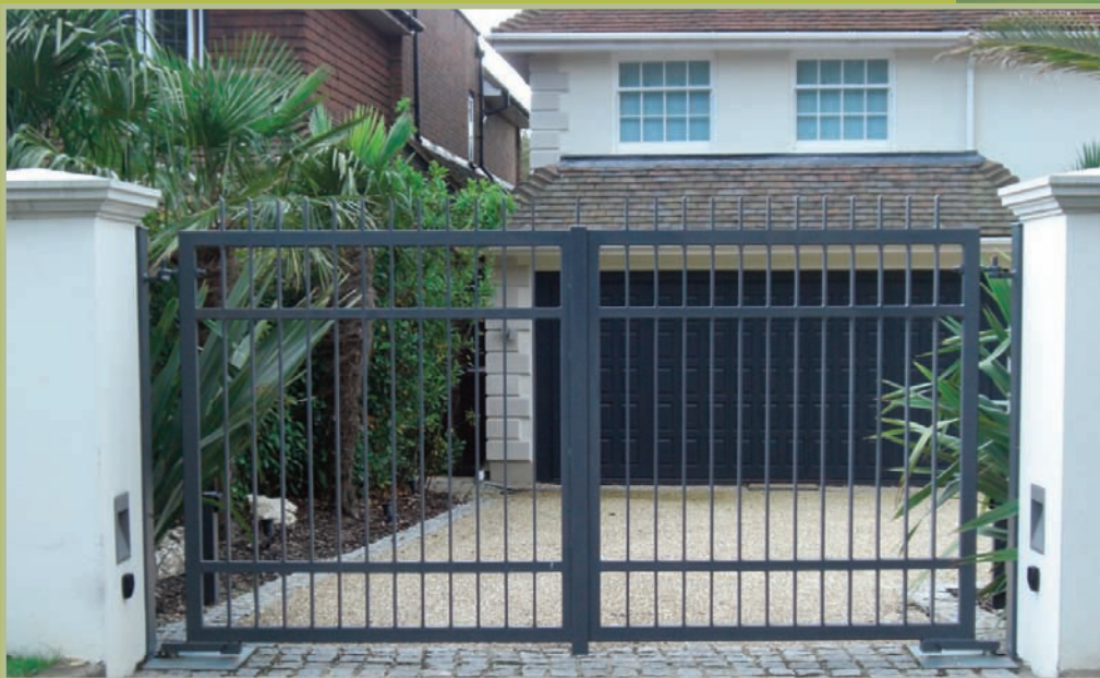
Grey powdercoated modern gates, with below ground operators. Harling 'Milton' design