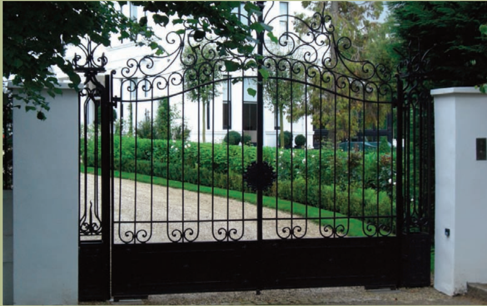
Grey powdercoated steel gates made to suit customers own design, automated with below ground operators