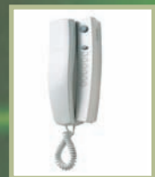
Internal handset for an Intercom system