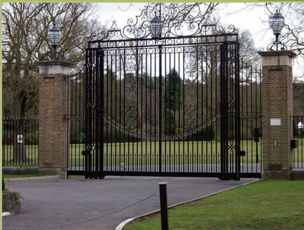
Large sliding gate with decorative infill, access control and traffic light system with ornate support posts and top arch. Gates were a bespoke design