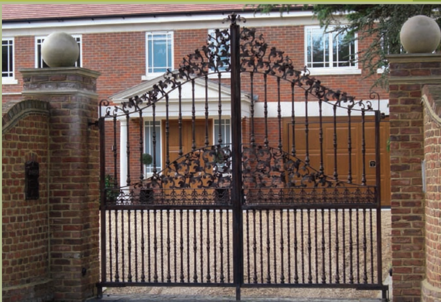
Gates with intercom system, powdercoated bronze, Harling 'Windsor Leaf' design