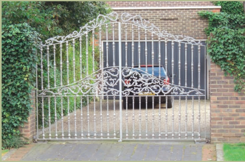
Decorative Gates powder coated silver for a residential project. Gates were a bespoke design