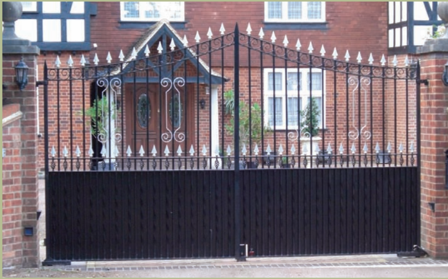
Gates with privacy panel, dog bars with below ground operators and gold painted infills. Harling 'Albert' design