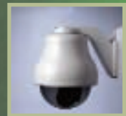
Wall mount vista dome