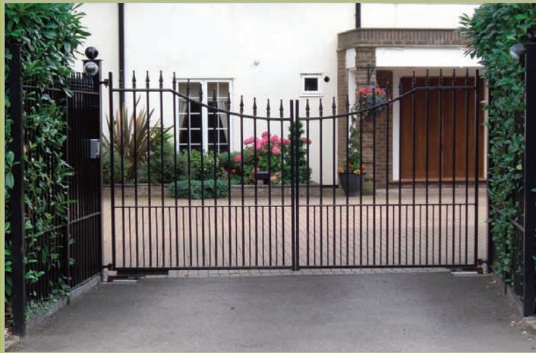
Automated Gates and Railings with basic railing design and dog bars at the bottom