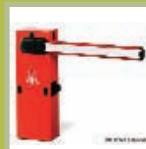
Automated Barrier available in a range of colours including stainless steel