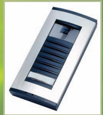
Targha video panel for an Intercom system