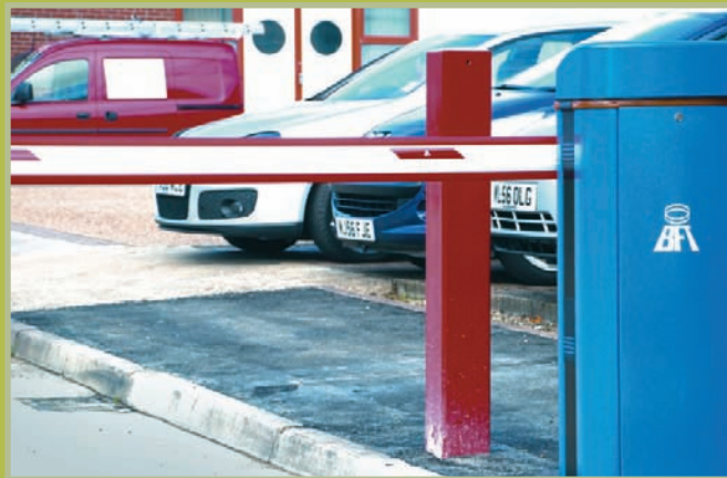
Automated Barrier with protective steel post installed next to it